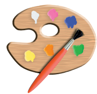
Music & Art Therapists